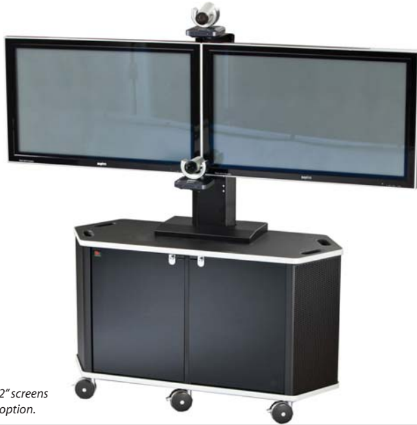
Shown with 42" screens and PM-CAM option.